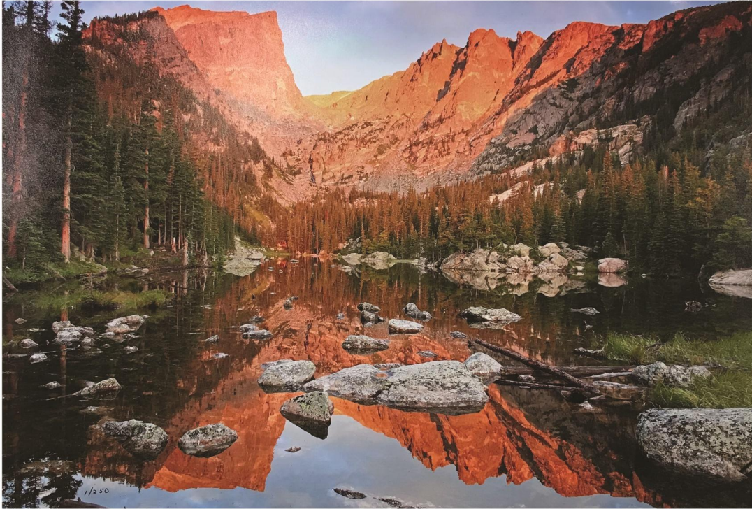
RON HALL, Sunrise at Dream Lake , $100

“This capture starts strong with a low detailed camera angle that draws us straight into the image from the ground up. This, along with the reflection of form split by the horizon of the shoreline adds a strong interest as well. The natural leading lines of the shore and trees lead us straight down water way and into the beautifully contrasting oranges and blues of sky, water, trees, and rocks.”