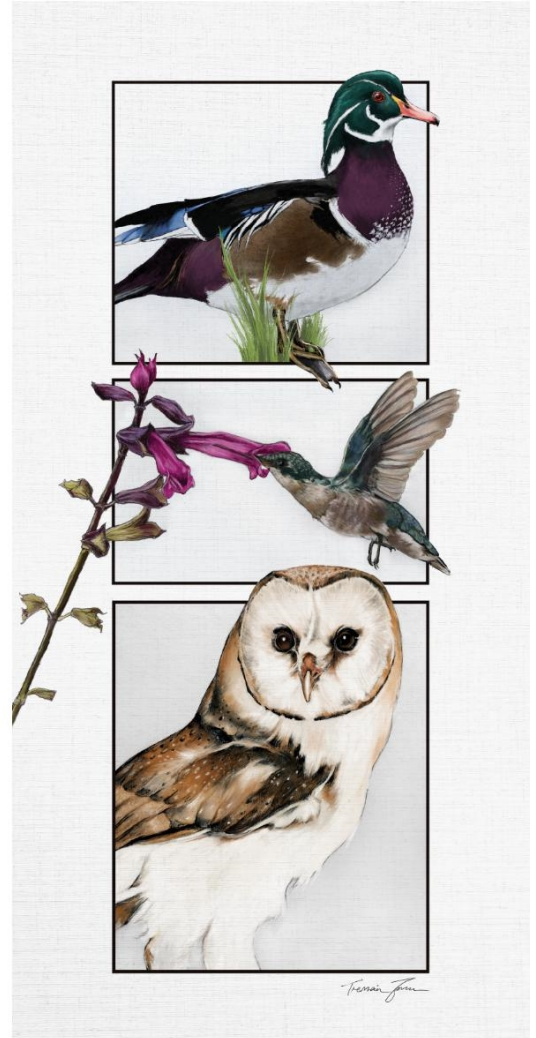
Tremain Farrar , Birds of a Feather Flock Together mixed media, $200