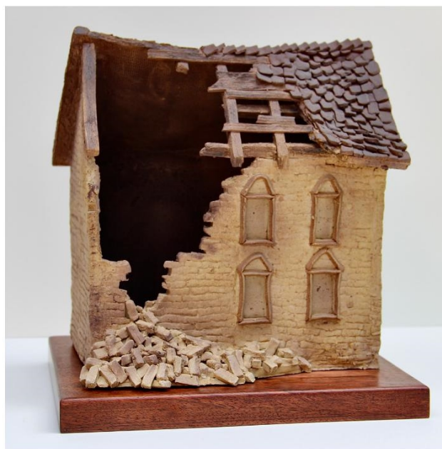
Joe Rohrman , Looks Can Be Deceiving clay & hardwood base, $250