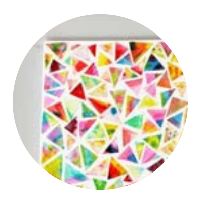
Image: Land Reclaims Land, Betty Knapp, AMOA Collection, 2019 Open Space

Students will work with local artist Betty Knapp to create their own pastel landscape. Learn tips and tricks on drawing vegetation, skies, and more. Please bring your own reference image. All other supplies will be included.