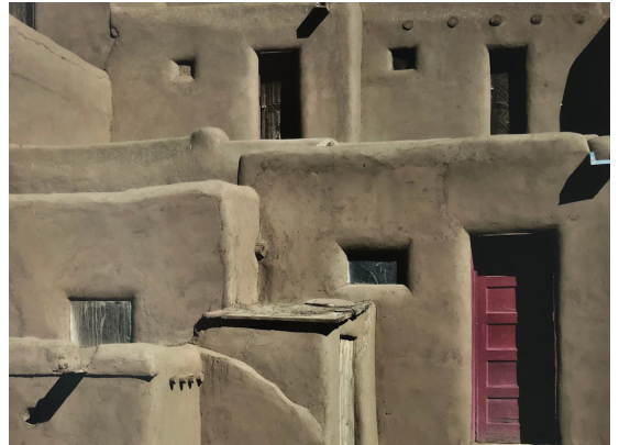
RON HALL , Red Door in the Morning $150