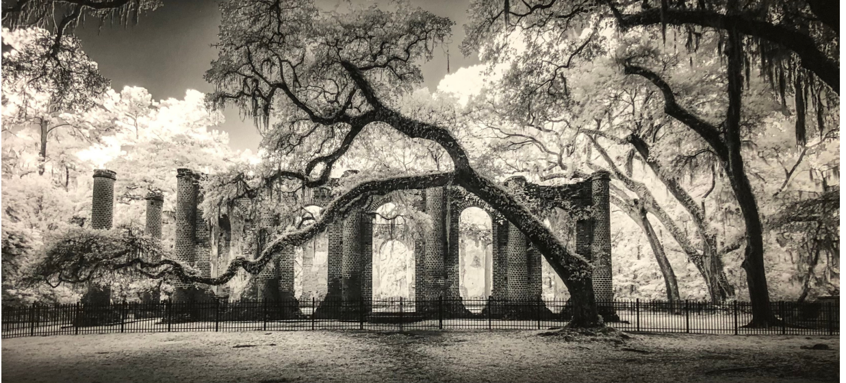
GIL JANEK, Sheldon Church Ruins , $100

A very impressive image, the contrast is very striking. Good composition and good choice on the use of a panoramic/landscape perspective as it adds to the overall impact of the image. Good use of leading lines drawing the viewer's eyes into the subject of the image. Very good contrast balance and overall lighting with no overblown whites, while still achieving details in the darker areas. Overall a very good work.