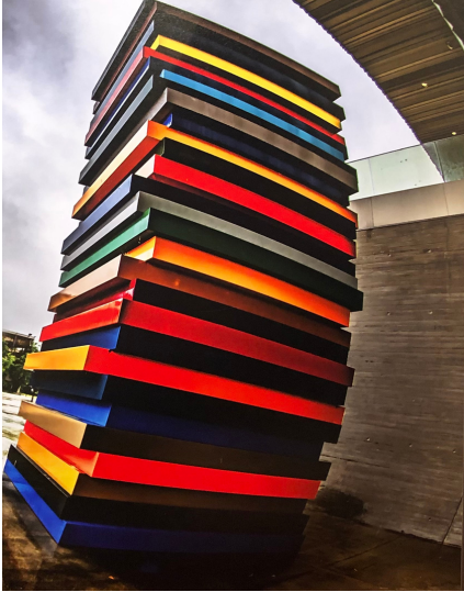
RAY GRIMBALL Topsy Turvy, NFS