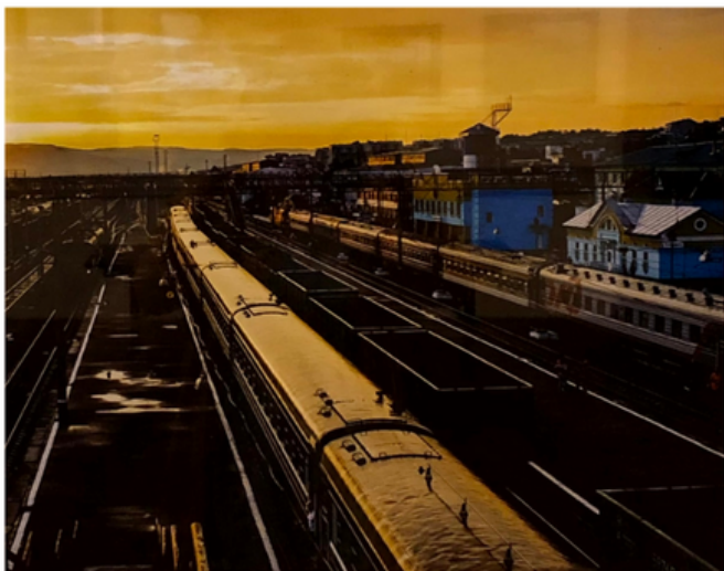
Jack Wickes, Railyard at Sunset , $365