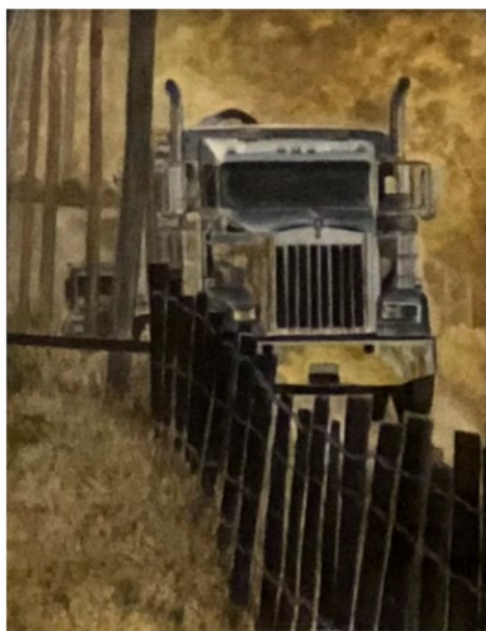
Judy Crist, Harvest on the Move , $350