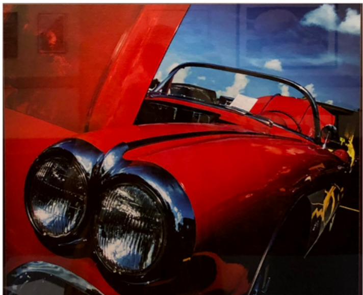
Ray Grimball, Candy Apple Ride , $175