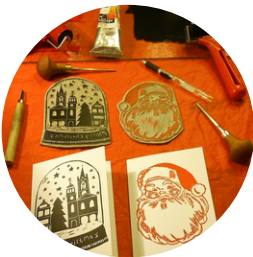
November 18: Linocut Christmas Cards