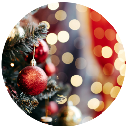
December 16: Christmas Craft