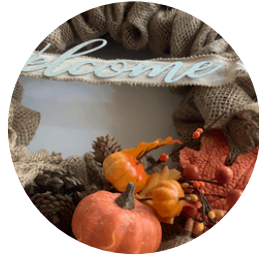
October 21: Burlap Wreath