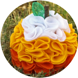
September 16: Candy Corn Ruffled Felt Pumpkin

No experience required! All supplies included.