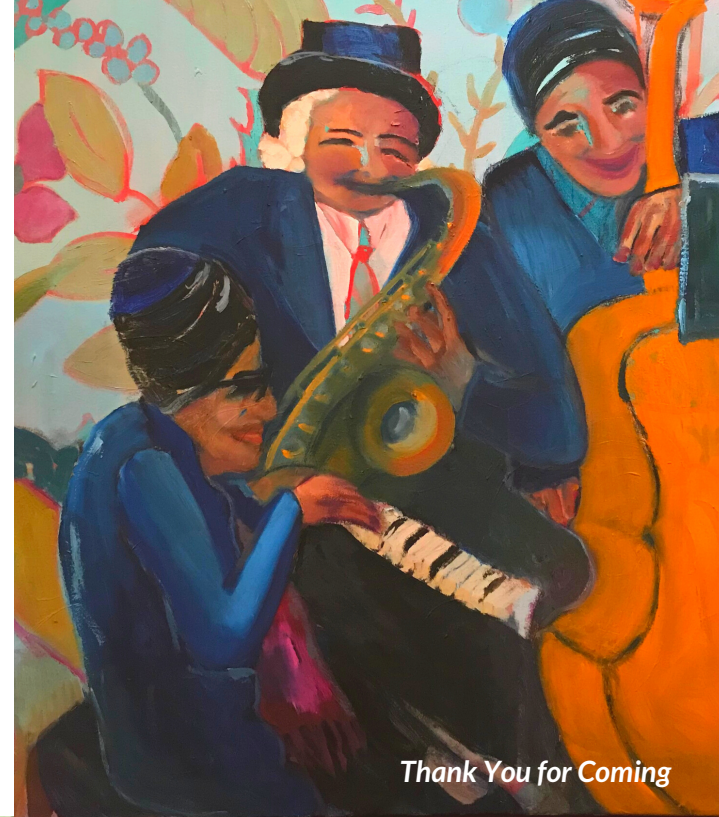
Thank You for Coming